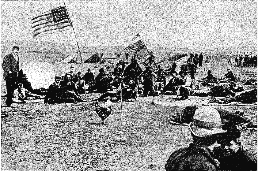
Figure 1: The Industrial Army makes camp as they travel through Iowa. Jack London is in the lower right hand corner. ( The Palimpsest, June 1971)