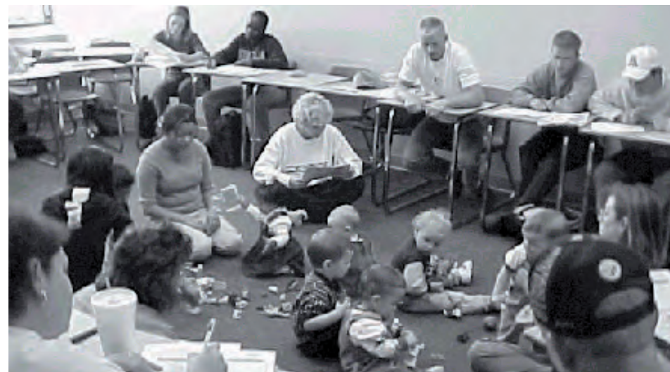
Developmental Psychology had baby day on Tuesday, September 26.