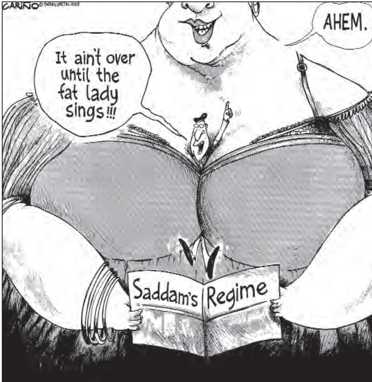
cartoon courtesy of krtcampus.com