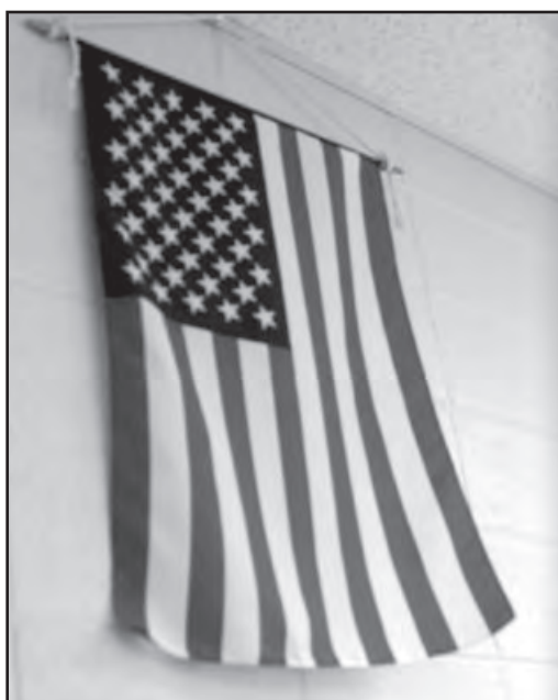
Flags purchased by the American Legion can be seen in every DMACC classroom.

The Boone American Legion donated the flags to DMACC, and all the other schools in Boone. The mission to get flags into classrooms started a year before the war when Veterans noticed that there were not flags in any classrooms.