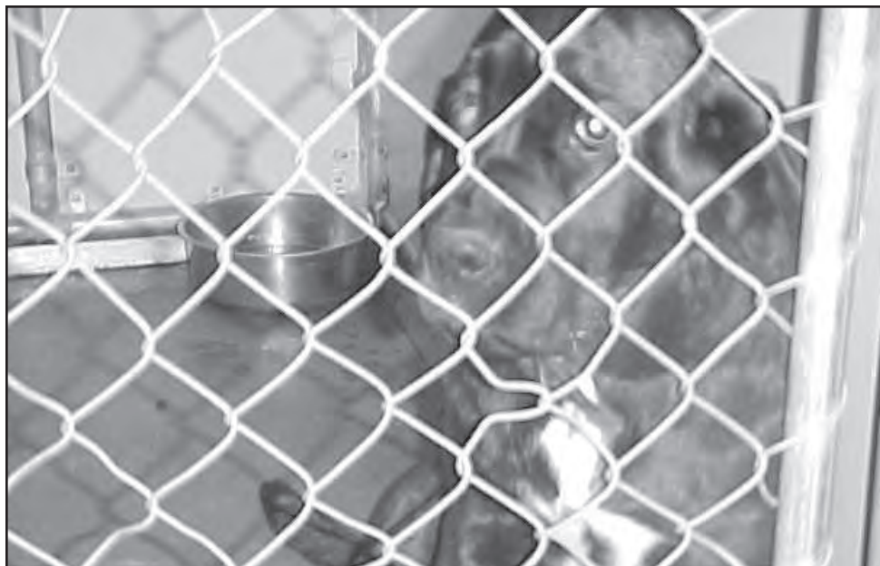
Many animals at the Humane Society were left behind by owners who couldn't meet the needs of their pets.

The puppy pictured is at the Ames Humane Society. College students owned the pup. When the puppy came down with a medical problem called Cherry Eye, the owners couldn't afford the surgery the pup needed. For this reason they had to give the animal up in the hopes that someone who