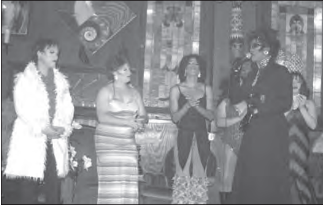
All performers after the drag show thank audience for coming.