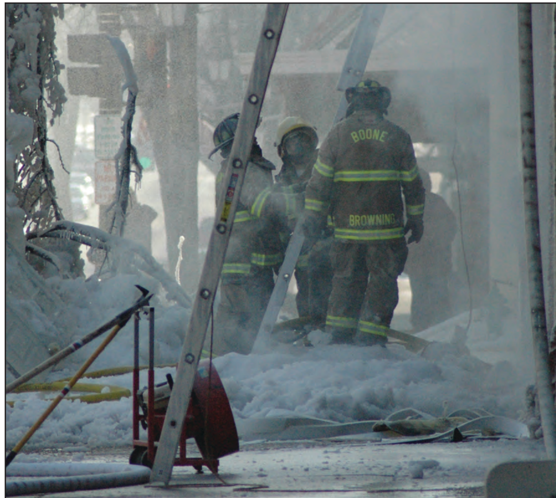
Above: Boone Firefighters prepare to enter the burning building.