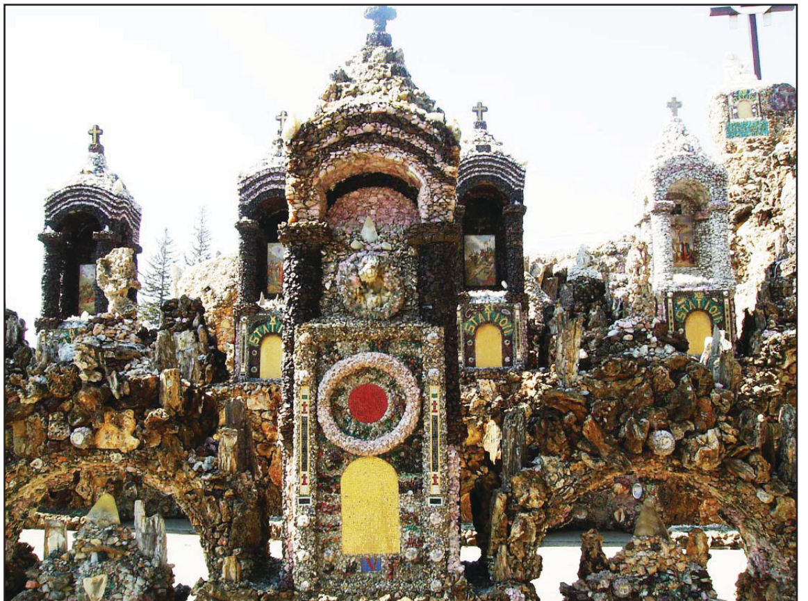
Here is the front view of the Stations of the Cross.

On the west side of the Grotto you have the final two areas the Bethlehem scene, and the scene of Jesus living in Nazareth. These are my least