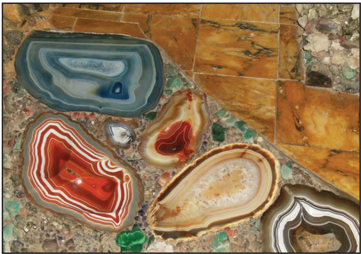
Assorted agates are displayed on nativity scene.