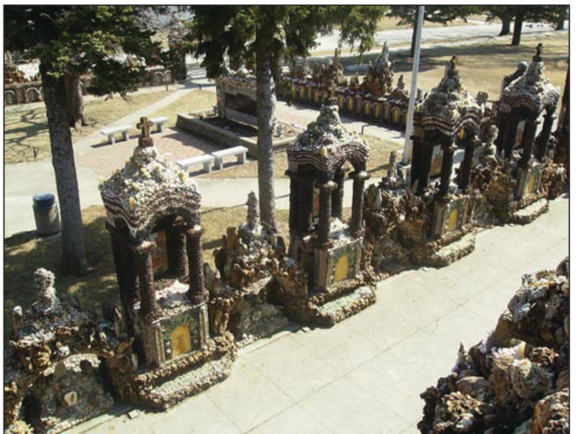
Stations of the Cross are viewed from the top of the Grotto.

favorite because they are both very plain and uninteresting. On the west end you also have a statue of Father Dobberstein and the museum dedicated to the Grotto's construction.