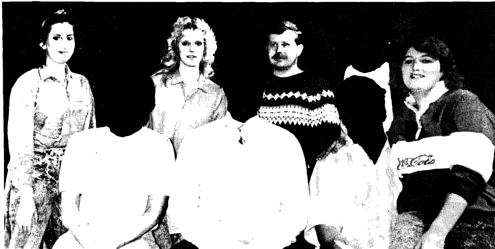
The Missing Thespians