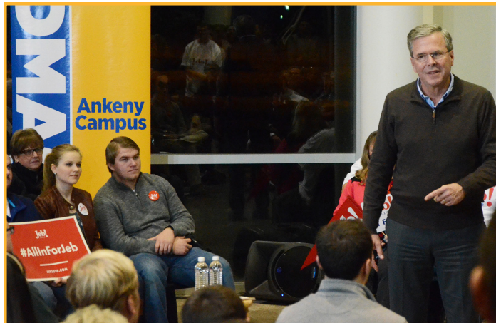
Governor Jeb Bush

On January 10, Democratic presidential candidate Senator Bernie Sanders (I-VT) spoke on the Ankeny campus.