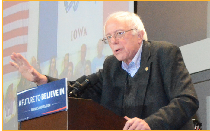
Senator Bernie Sanders

As the countdown to the Iowa caucuses closed in on February 1, several presidential hopefuls held rallies on DMACC campuses.