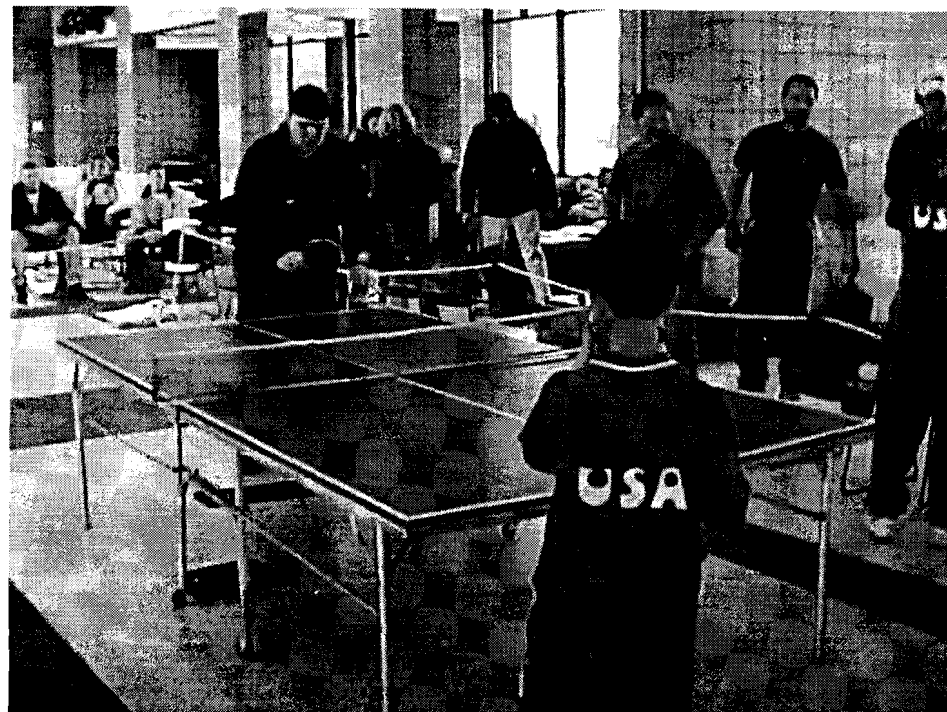
Table tennis exhibition draws 150