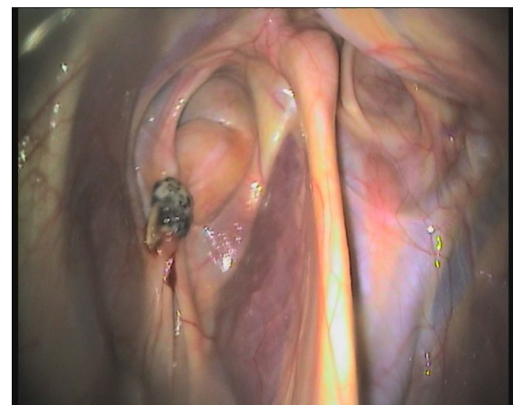
Figure 2. Guttural pouch mycosis

During the examination of this area, attention should be paid to the appearance of mucosa, pulmonary vascularity, and the presence of any lesions and erosions. The location of the epiglottis should be dorsal to the palate,