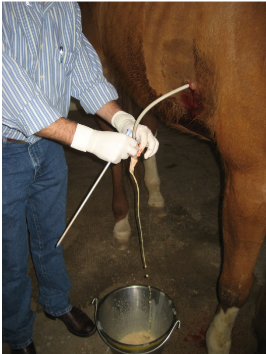
Figure 4. Performance of thoracentesis in horse

The chest puncture technique is relatively simple. Thoracentesis is performed between the 6th and 7th intercostal spaces, 3–4 cm above the cartilage–bone connection (Figure 4). Prior to surgery, the injection site should be prepared by carefully shaving, washing and disinfecting an area measuring 5x5cm, whose central point corresponds to the puncture site. Thus prepared, the operating field should be anesthetized using a sterile anesthetic agent. The puncture is performed with a thick puncture needle or a device comprising a needle and a catheter which must be connected to a three-way stopcock. It is connected with a 30 or 50 ml syringe and a conduit to discharge the syringe. There are also ready-made, disposable sets of needles, syringes, stopcocks and catheters designed for easy, safe puncturing of the pleural cavity. The needle should be inserted perpendicularly to the skin, along the front edge of the rib, which allows the vein, artery and nerve located on the back to be avoided. To prevent damage to the lungs, it is recommended not to aspire fluid from the pleural cavity under a high vacuum (Light, 1990).