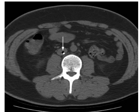
Figure 1 Air bubble trapped around the central venous catheter in the inferior vena cava (arrow) was incidentally noted on non-enhanced CT scan of the abdomen.

Normal lung tissue receives dual blood supply from pulmonary and bronchial arteries. Pulmonary infarct is infrequent after acute obstruction of the pulmonary artery because the bronchial circulation plays an important role