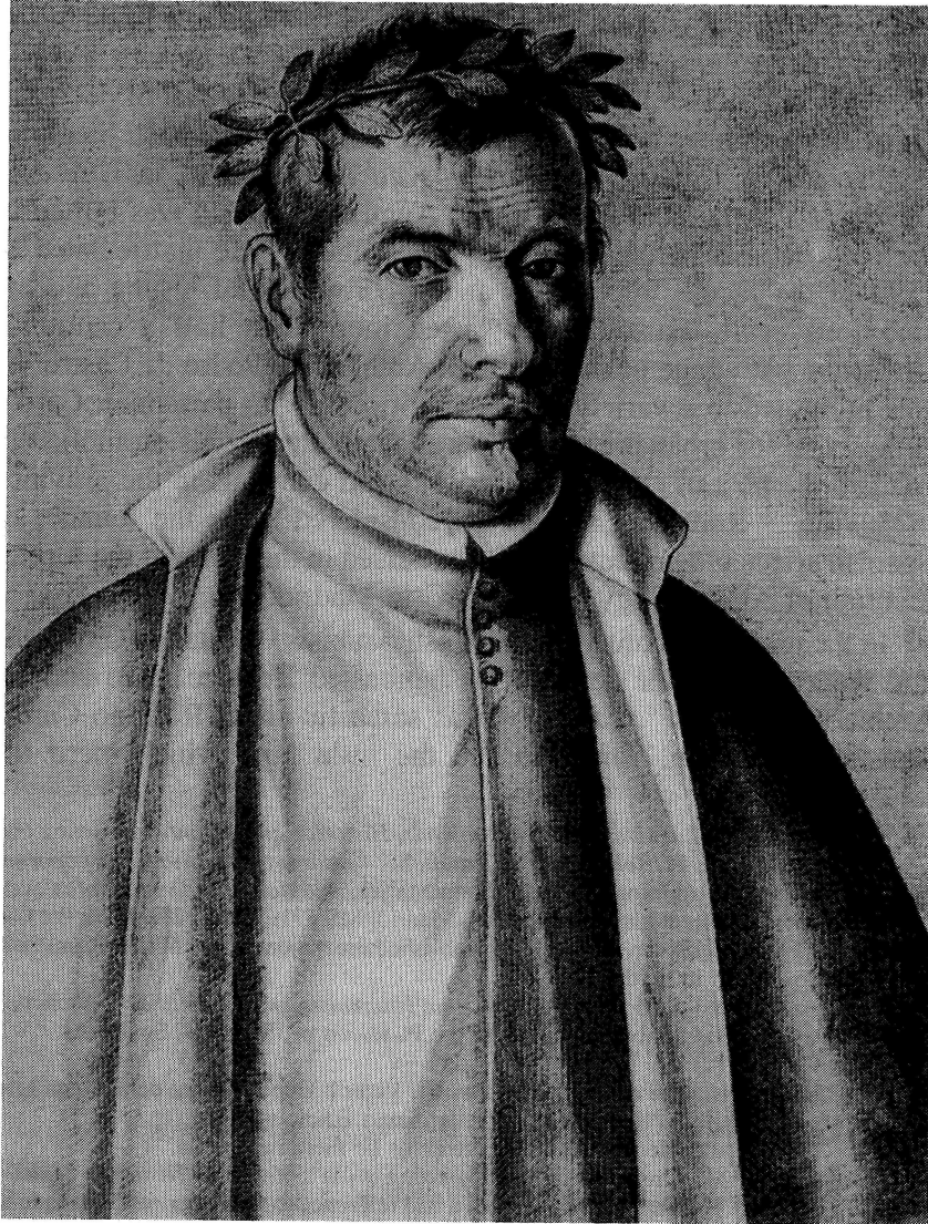
Portrait of Rodrigo Caro from the Pacheco Manuscript in the Biblioteca Lázaro Galdiano (Madrid)