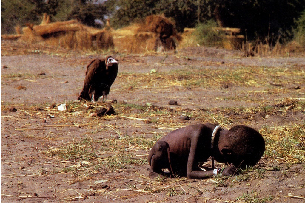
Figure 1: Photo: Kevin Carter

naïve question of the New York Times readers was: ‘Did the photographer stop and help this suffering child?’ 2 When it became clear that Carter had done nothing to help the little girl, he was broadly criticized in popular media.