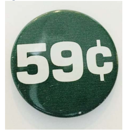
Figure 2: The 59 Cent Button

used to educate society on the wage differences between men and women. This gap has fluctuated through the years but has generally been decreasing, but not by much. Between 1963 and 2016, the gap has only decreased by less than one-half of a percent per year on average. The full graph is in Figure 3. "Based on its research, the Institute for Women's Policy Research estimated in 2015 that women won't receive equal pay until 2059," ("Pay Equity" 2017).