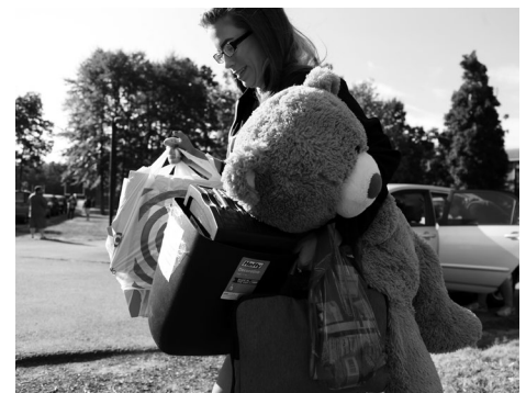
A first-year student brings the comforts of home to her dorm room during this year's move-in.