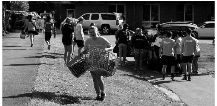
A Merrimack Orientation Leader helps unload cars and carry items into first year student rooms.