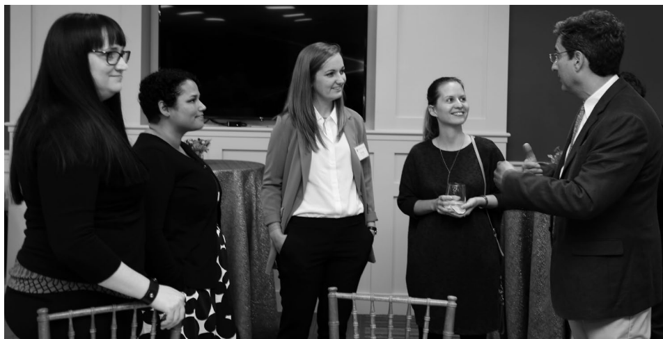
New faculty members get some pointers from an existing faculty member during a dinner reception welcoming new faculty members to campus.