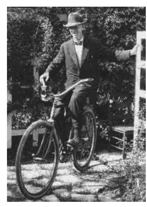
Figure 7 - Ernest Hemingway on a bicycle <http://www.indybikehiker.com/2010/02/ hemingway-on-riding-bicycle.html>

In The Sun Also Rises (1926), Hemingway uses bicycle racers to draw attention to