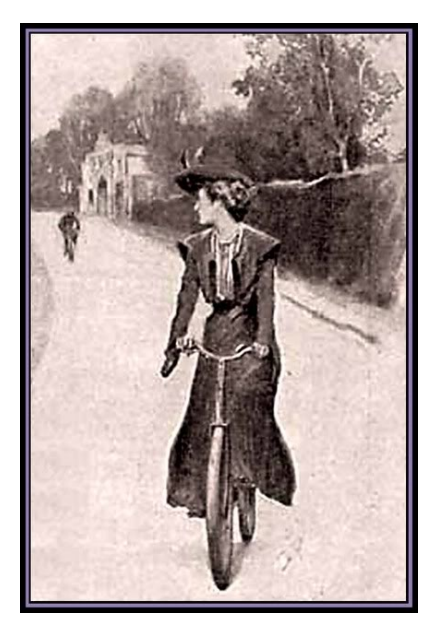
Figure 5 - Miss Violet Smith on her bicycle. Illustration by Sidney Paget for "The Adventure of the Solitary Cyclist" published in The Strand January 1904.

by train and by bicycle between Farnham and Chiltern