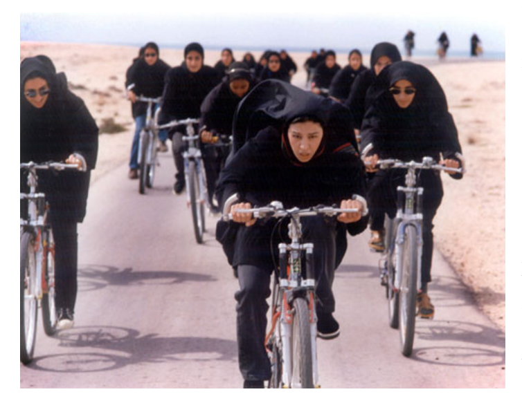
Figure 8 – From the film "The Day I Became a Woman" (2000) in which an Iranian woman asserts her independence and defies her husband by participating in a bicycle race. Directed by Marziyeh Meshkini. <http://dryden.eastmanhouse.org/films/2007/02/the-day-i-became-a-woman>

Over one hundred years after the modern bicycle was designed, it remains an integral part of western culture. For children, learning to ride without training wheels is a rite of passage. As adults, this machine continues to intrigue us and summon us to escape, even if it is only in memory or wistful thinking. On a bicycle, even for a short