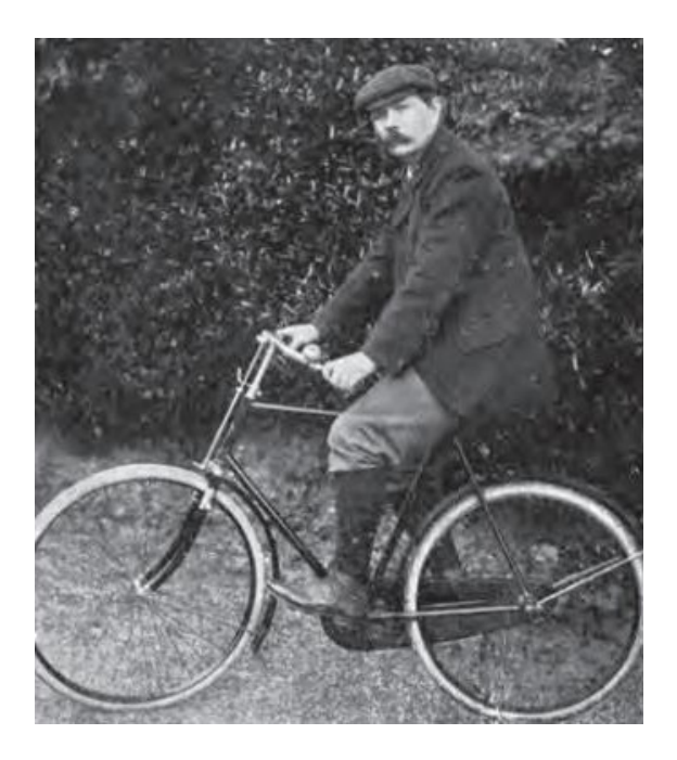
Figure 1 - Arthur Conan Doyle on a safety bicycle. <www.musicbicycles.blogspot.com>

vehicles included velocipedes and draisines without pedal systems, precarious high wheels, tricycles and quadricycles. But David V. Herlihy in Bicycle: The History explains that it was the invention of the safety bicycle in the 1880s, and the near simultaneous introduction of the pneumatic inner tube and tire system developed by Edouard Michelin, that caused the bicycle explosion (252). Herlihy states that with rapidly improving designs to the low