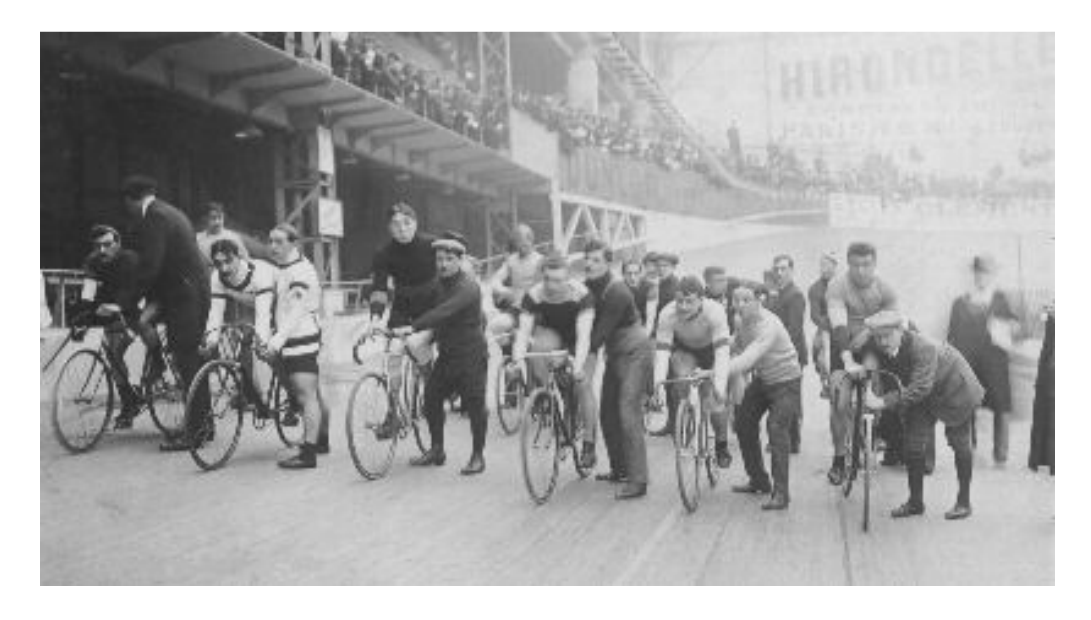
Figure 6 - Start of a bicycle race at Le Velodrome d'Hiver, Paris, circa 1920. <a href="http://www.ciclisucarta.it/images/paris1.jpg">http://www.ciclisucarta.it/images/paris1.jpg</a>

He describes various different types of races and illustrates his thorough knowledge of the sport.