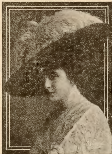
BILLIE BURKE in "LOVE WATCHES."

Billie Burke's coming to the Empire Theatre on Friday evening, March 5th, will be the event of a more or less busy theatrical season. The young woman who charmed everybody by her delightful simplicity and insinuating personality as John Drew's leading woman, is said to have a play of even more delightful humor than "My Wife," in the new French comedy "Love Watches."