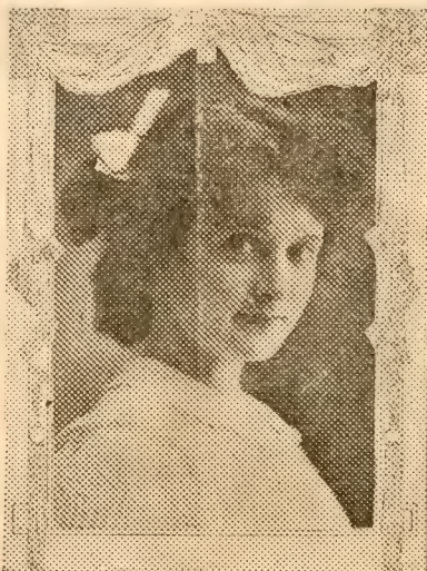
BILLIE BURKE IN "LOVE WATCHES" FRIDAY, MARCH 5th.