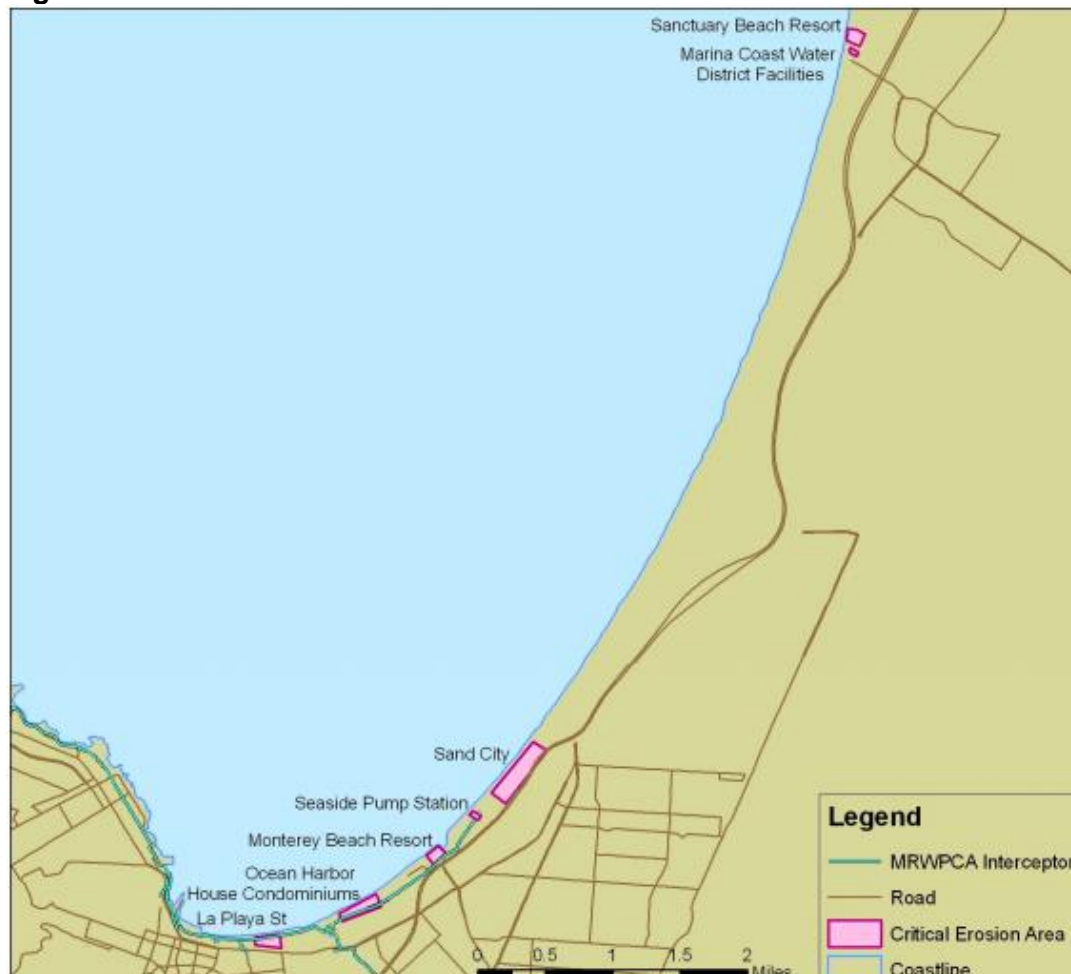
Figure 3: Locations of critical areas of erosion