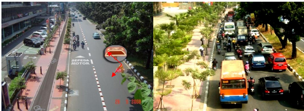
Left: Illustration of Motorcycle Lanes

Motorcycle lanes were applied in Jakarta in the late 2006. In December 2006, Metro Jaya Regional Police, in cooperation with Transport Agency, conducted a campaign program for motorcycles to move on the leftmost lanes and turn on the light. The fines for motorcyclists who violate the rule is applied starting in January 2007. However, this program did not last long. In mid 2007, many motorcycles traveled on the middle lane or even in the rightmost lane.