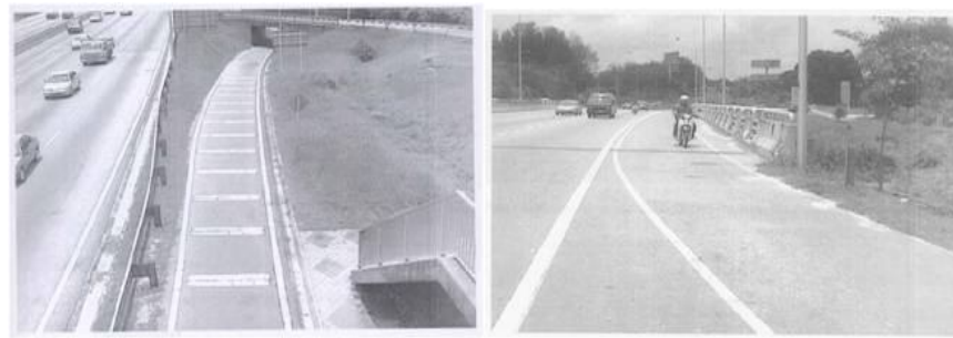
Left: Exclusive Lane

the left most of mixed traffic road, usually in the form of paved shoulder. Law and Sohadi also found that recommended safe width for motorcycle exclusive lane is 3.81 meter.