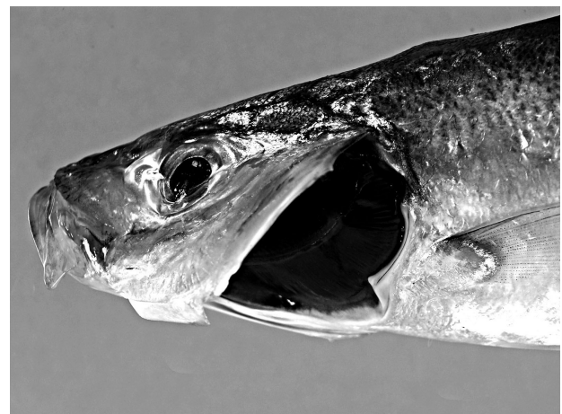
FIG. 2. – Shoulder girdle (cleithrum) of Decapterus russelli (154 mm SL) from Haifa Bay, Israel, showing the two papillae.

Decapterus russelli has a wide Indo-Pacific distribution from the Red Sea and east Africa to Japan and Australia (Smith-Vaniz, 1984). It was recorded from the Gulf of Suez by several authors (Rüppell, 1830; Norman, 1935) as Caranx russelli and as Decapterus kiliche by Bertin and Dollfus (1948) and Demidov and Viskrebentsev (1970). Steinitz (1927) reported Caranx kiliche Cuvier and Valenciennes 1833, which is now considered as a junior synonym, off the Mediterranean coast of Palestine/pre-state Israel; his presumed misidentification (Tortonese, 1952; Golani et al. , 2002) was repeated by several authors (see: Ben-Tuvia, 1966). Until the present report, no specimen of D. russelli had been reported in the Mediterranean.