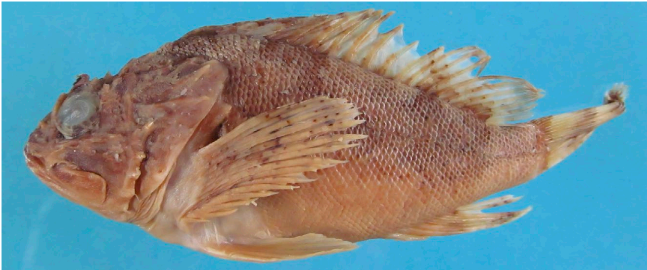
Fig. 1. – Scorpaena decemradiata n. sp., HUI 2418, holotype, 123.1 mm SL, Red Sea, Gulf of Aqaba, Israel, Eilat, 1960. Lateral view; photograph of the colouration in preservative taken 56 years after collection (Photograph: D. Golani).

Selected body proportions and counts, included in Table 1, are part of the description.