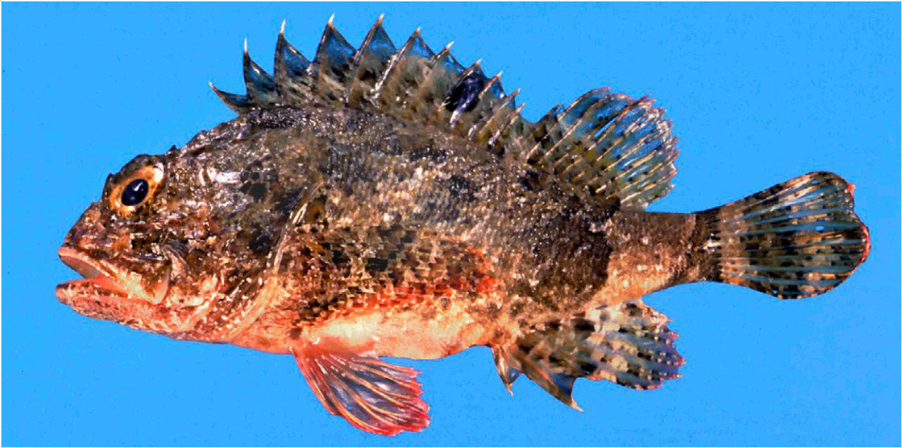
Fig. 3. – Scorpaena porcus Linnaeus, 1758, HJ 12258, 153 mm SL, Jaffa, Israel, Mediterranean Sea, 23 Apr. 1987. Lateral view; photograph of the fresh colouration taken a few hours after collection (Photograph: D. Darom).