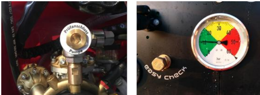
Figure 1. The sprayer shall be provided with a device for an easily connection of instruments used during the mandatory inspection of sprayers in use according ISO 16122. Left: easy adaptor for pump tester; right, easy plugging adaptor for testing manometer.

As a practical guideline, most of the items included on it have been accompanied with explanatory figures or schemes. The main objective of this guideline is to be used as a practical document to help farmers during the process of sprayer selection. Figures 1 and 2 are some examples of graphical information included on the guideline.