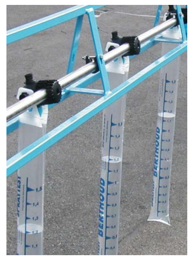
Figure 2: Spraytest bags

To check application rate and sprayer speed, the following method was used till 2009: Two marking points were placed with a distance of 100 m in between with at least 10 to 20 m of free "run in" track before the start of the 100 m track. Farmers/fruit-growers were asked to program their usual application rate and to start a first short run (e.g. about 20 m) at a constant speed. During this run, the rate controller could adjust the control valve to obtain the desired application rate. After this run, the farmer was asked to stop spraying by shutting of the main valve and the inspector placed 3 spray test sacs underneath three nozzles (Figure 2).