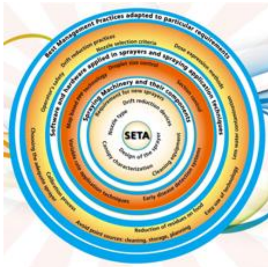
Figure 3. Examples of SETA (inner to outer circle: Spraying Machinery and their components, Software and hardware in sprayers and spraying application techniques, Best Management Practices adapted to particular requirements)

Novel SETA has a real potential to deliver a more productive and sustainable agricultural production, based on a more precise and PPP-efficient approach, especially in a scenario of farming labour shortage and climate change. However, novel SETA (Fig. 3) are not widely implemented throughout Europe, except in some advanced European countries (i.e. Germany, Netherlands, Sweden and Denmark), where there are still a large number of innovations in spraying technology to be adapted. Improvement of training activities have been widely underlined as the most efficient tools to improve the application-phase of PPP in EU members with lower technological level and higher number of small and traditional farmers (i.e. Mediterranean countries), while in large agriculture productions from the North of Europe, new technological improvements and developments are largely appreciated.