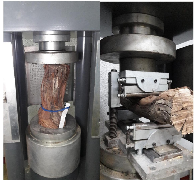
Fig. 2: A) Compression test of grapevine wood trunks; B) Flexural test of grapevine wood branches.

horizontal plane to the longitudinal axis of the sample) and the number of knots (if the sample had them). The presence of knots in this kind of wood is almost unavoidable, however as their size is similar for similar diameter sizes on samples with the same age and pruning methodology, their effect on the strength behaviour should be negligible.