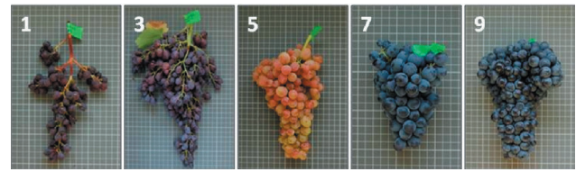
Fig. 1: Grape bunches showing different grade of compactness according to the O.I.V. 204 descriptor (O.I.V. 2007). 1: Very loose bunch ('Aramon'); 3: Loose bunch ('Ruby Seedless'); 5: Medium bunch ('Naparo'); 7: Dense bunch ('Monastrell'); 9: Very dense bunch ('Bobal'). Squares in the background have 1 cm 2 .

In this sense, the aim of this study was to evaluate the usefulness of several indexes, either previously published in literature or newly designed, for an objective and quantitative estimation of bunch compactness that was useful for intervarietal studies of this trait, knowing that compactness could be affected by different factors in different varieties.