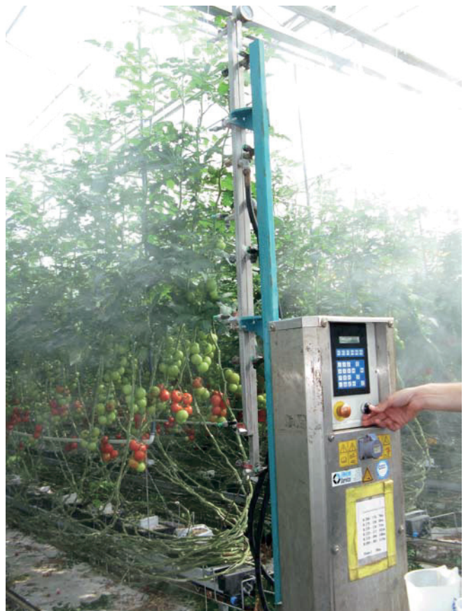
Fig. 1. Application of XenTari® with a half automatic application robot (Meto, Berghortimotive) (left), and with reduced numbers of opened nozzles (right).