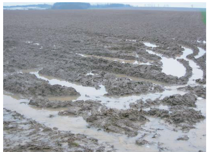
Fig. 4. Soil compaction which can be found regularly on headlands decreases the infiltration rate of soils.

To calculate different infiltration scenarios in relation with different land-use concepts, the concept of the HOT model (Help of Organics against Torrents) has been developed by a research group of the Julius Kühn-Institut (LILIENTHAL and SCHNUG, 2008; ABU-HASHIM, 2011). This model may induce a compensation of anthropogenic induced soil sealing by promoting the change from conventional to organic farming in areas with regularly occurring flooding events. With view to prophylactic flood control a spatial enlargement of organic farming as a compensation measure for anthropogenic soil sealing is implicitly desirable and should be promoted by agricultural policy (LILIENTHAL and SCHNUG, 2008). It is recommended to affiliate organic farming in sensitive areas as a local cross-compliance and premium pays offer additional bonus for aggrieved parties and consumers which is the availability of local, high-quality produce in the vicinity of urban centres.