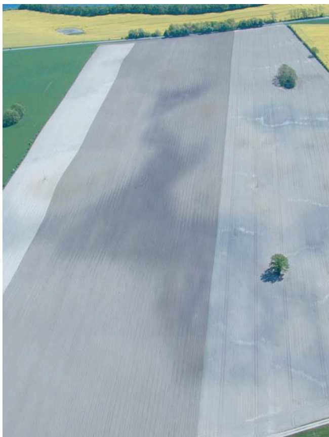
Fig. 1. Small-scale spatial variability of soil characteristics.

to minimise the risk of water, air and soil pollution. One aim of the implementation of national GAP codes is the reduction of the discharge of nutrients which is closely related to stocking densities in animal production and the high and improper use of fertilisers (SCHNUG et al., 2011). GAP applications can be developed for instance by governments, NGOs and the private sector to improve sustainability of management practices in relation to specific requirements.