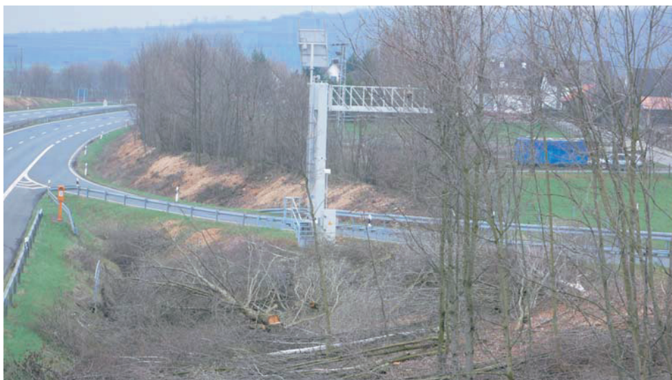
Fig. 5. Short rotation forestry along roadsides bear a significant potential for the production of bio-energy.