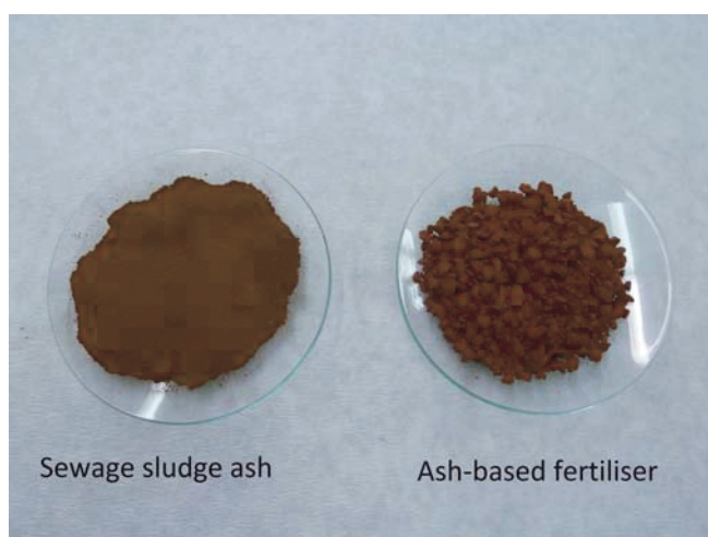
Fig. 3. Sewage sludge ash (left) and pelletized, thermochemically treated sewage sludge ash (right).