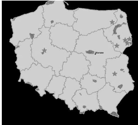
Fig. 2: The localization of the main companies sourcing in nature.

the magic and power of such activity like wild collection realized in heart of nature and appreciation of its goods".