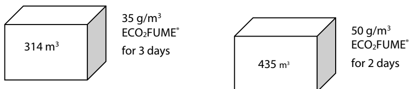
Fig. 2 Bag stack arrangement of milled rice in 1,000 kg - jumbo bags

2) Milled rice in a jumbo bag of 1,000 kg capacity (raw material rice) and a stack size of 314 m 3 was treated with a 35 g/m 3 ECO 2 FUME ® application rate (500 ppm phosphine) for 3 days, and a stack size of 435 m 3 was treated with 50 g/m 3 ECO 2 FUME ® application rate (700 ppm phosphine) for 2 days (Figure 2).