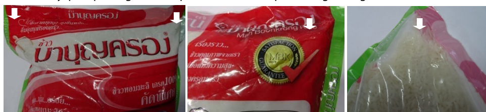
Two holes on the front of the plastic bag

The commercial 5-kg plastic bag of milled rice in the market of Thailand was punched 4 holes with diameter 1.0 mm. On the front and back of the bag, 2 holes were punched for each side. These holes allowed the air transfer which the bag could be stacked on the shelf during the distribution. Additionally, phosphine gas would penetrate into the plastic bag through these holes.