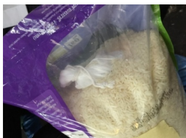
Fig. 4. Test insect placement inside the commercial 5-kg plastic bag.

The commercial 5-kg plastic bag of milled rice in the market of Thailand was punched 4 holes with diameter 1.0 mm. On the front and back of the bag, 2 holes were punched for each side. These holes allowed the air transfer which the bag could be stacked on the shelf during the distribution. Additionally, phosphine gas would penetrate into the plastic bag through these holes.