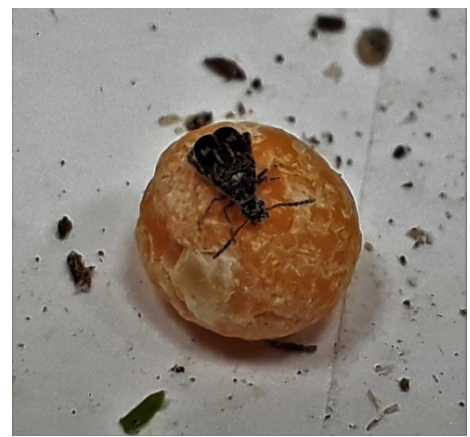
Fig. 2 Male imago of the four-spotted bean weevil Callosobruchus maculatus F. feeds on a pea seed.

In practice, the Russia's federal service for veterinary and phytosanitary surveillance uses a complex visual method to identify the four-spotted bean weevil. But one may significantly reduce labor costs and improve efficiency of quarantine monitoring of beetles by using pheromone traps in the field and storages for monitoring and identification (Smetnik et al. , 1986; Burov and Sazonov, 1987; Phillips et al. , 1996). Synthetic pheromone was synthesized at the Department of Synthesis and Application of Pheromones in All-Russia Plant Quarantine Center in 2012. In laboratory tests with olfactometer synthesized pheromone has attracted males of C. maculatus effectively at dose of 0.5 µg. The experiments as well have shown that the concentration of pheromone above 2 µg does not cause behavioral responses by beetles and doesn't result in their contact with the stimulus (dispenser).