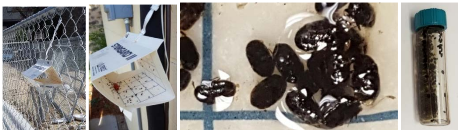
Fig. 2 Storgard II sticky trap hung on a fence near the periphery of a research site (left). Beetles fly to the red rubber stopper that is slowly releasing the synthetic female sex pheromone, and then are stuck on the sticky trapping surface inside the trap (second from left). Adult Trogoderma are found in the trap (second from right), removed and cleaned in solvent prior to being identified to species and counted (right).