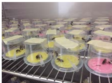
Fig. 3 group feeding with 2 bees per cage (OECD 213)