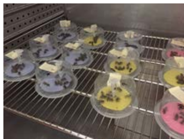
Fig. 4 group feeding with 10 bees per cage (OECD 213)