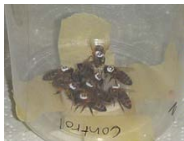
Fig. 2 group feeding with 10 bees (tagged with RFID chip) per cage

Acute Toxicity Test: According to the TG OECD 213, bees were orally exposed to different concentrations of dimethoate (0, 0.033, 0.07, 0.1, 0.13, and 0.35 µg/bee). As above, oral treatment scheme was performed three times for both groups (two and ten bees/cage). Mortality was assessed after 24h (fig. 3;4).