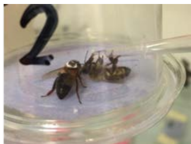
Fig. 1 group feeding with 2 bees (tagged with RFID chip) per cage

RFID Homing flight ring-test: According to the homing flight ring-test protocol, bees were orally exposed to different sub-lethal concentrations of thiamethoxam (0, 0.11, 0.33 or 1 ng/bee). For each treatment scheme (two and ten bees/cage), three runs were conducted between June and July 2017 in Liebefeld, Switzerland (fig.1;2). In all treatment-groups, homing flight success was assessed after 24h.