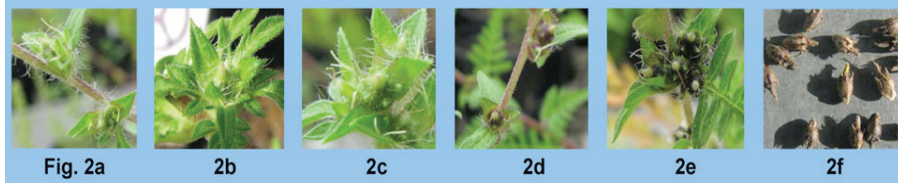
Fig. 2: Developmental stages of the female flowers of A. artemisiifolia in the post-harvest ripening test: