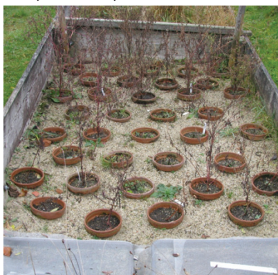
Fig. 1: A. artemisiifolia cultivated in pots

All cut branches were left on the soil surface for post-harvest ripening until end of autumn (Fig. 3). In December, the seeds yielded from the experiments were stored for 90 days at 4°C. After this stratification they were tested with regard to their germination capacity and dormancy/viability. Germination tests were run 2 times 4 weeks each term interrupted by second 5 months stratification. Seeds were germinated in petri dishes at 16/8 h darkness/light and 15/30°C. The TTC-test for viability of assumedly dormant seeds was done after the last germination trial (6 hours staining at 30°C in darkness, 1% Tetrazolium solution applied). Each treatment was tested with a subsample of 2 x 15 seeds except for those that yielded only 5 seeds each.