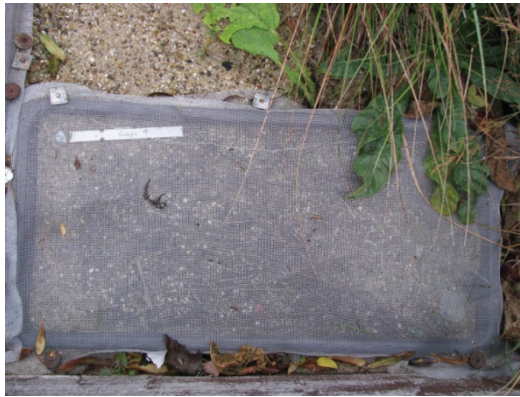
Fig. 3: A. artemisiifolia cut branches covered by a fine net to protect against seed predators