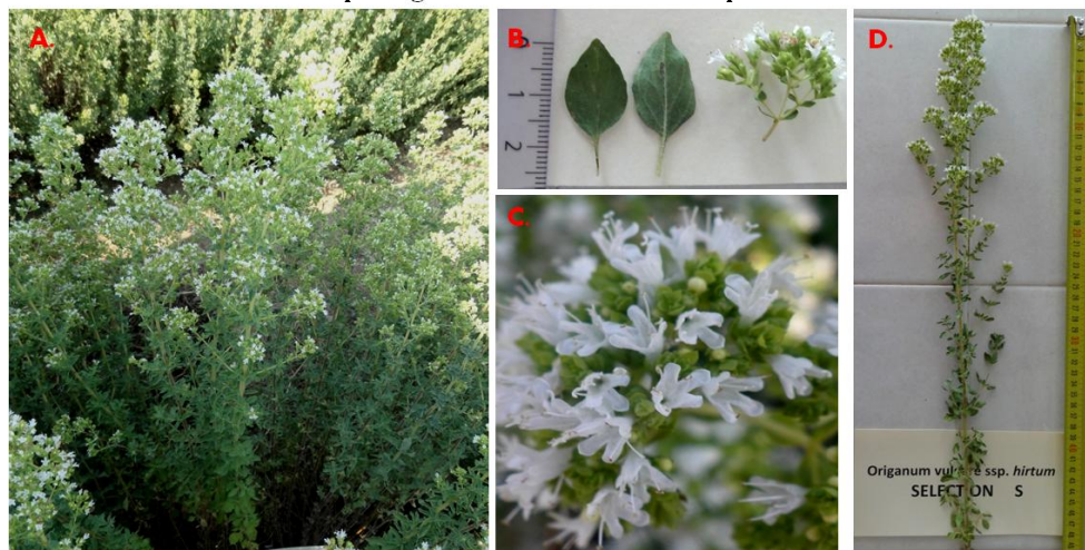
Fig. 3 Morphological characteristics of selected plants from population (No 16) of Origanum vulgare ssp. hirtum .