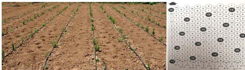
Figure 1. The R-13 honeycomb design used for the breeding program of Origanum vulgare ssp. hirtum (population No 16). Each entry is allocated in such a way that is always surrounded by plants of all the other twelve entries.

cal and biochemical characteristics. Among them, population No. 16, with desirable characteristics, was propagated with stem cuttings and seeds and was experimentally cultivated. Plants from the specific population, derived both from open (OP) and self pollination (SP), were used for the establishment of an R-13 honeycomb experimental design (Figure 1).