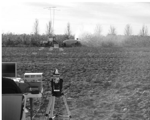
Fig. 1. Lidar system (foreground) measuring the spray drift generated by the sprayer (background).

Pesticide spray drift is usually measured by means of passive collectors and tracers. However, there are several drawbacks to their use, related to the fact of being a time-consuming, single-point and time-averaged sampling methodology. Alternative methodologies are being searched in order to overcome these difficulties. In this line, lidar technology is one of the most promising alternatives since it can measure the spray drift in real-time, with high range resolution, requires little labour and low time consumption, and it does not need chemical analysis (Gregorio et al, 2014). In spite of these advantages, so far lidar systems have been used in a limited number of spray drift studies (Hiscox et al., 2006; Khot et al., 2011) due to its high cost, complexity and the fact that most systems are not eye-safe. This article compares the measurements obtained with a new lidar system specifically developed for spray drift monitoring with those obtained using passive collectors following the ISO 22866 standard.