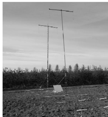
Fig. 2. Horizontal and vertical collectors distribution (ISO 22866), and the mirror.