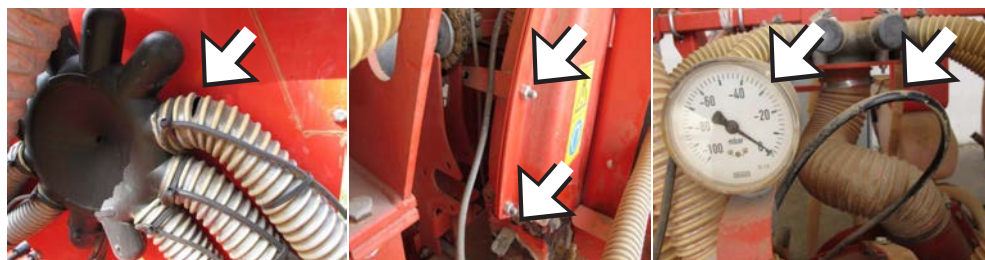
Fig. 2. Some sensitive points to be periodically checked in order to maintain the drill efficiency.

4) Sensitive points to be checked during the inspection of pneumatic drills in use - In addition to the presence and efficiency of the specific device for the reduction of the dispersion of dust during the sowing, there are different points through which the dust can be expelled and parts directly involved in the efficiency of the machines. These parts (Fig. 2) should be checked periodically in order to maintain the drill efficiency. A possible list of such controls should include: 1) the status of the pipes of the pneumatic system of the drill; 2) the status of the gasket sealing the connection between the flange supporting the deflector pipes and the outlet opening of the vacuum fan; 3) the functionality of the pressure gauge (correct depression value help to limit dust dispersion).