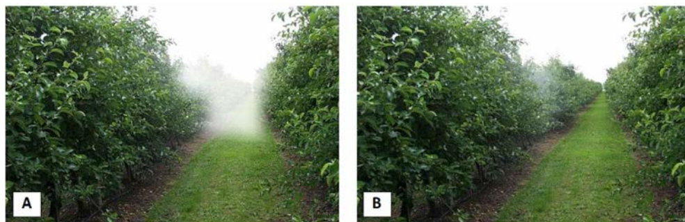
Fig. 2. Air flow adjustment: A – to big air flow volume resulting in spectacular spray loss; B – correctly adjusted air flow volume with minimum spray loss.

Thus, the setting of the air flow aims at minimum spray loss because at the same time it is also likely to enhance on-target spray deposition. Since the loss of spray to the air (drift) is spectacular the correct air setting may be assessed visually by the grower himself when spraying on trees with clean water.