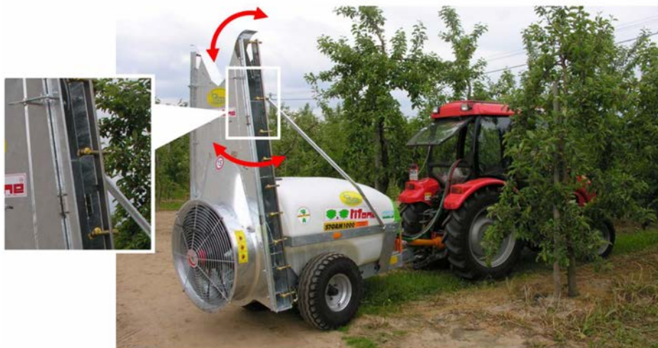
Fig. 3. Cross-flow sprayer with an adjustable air deflector: top vane to adjust air flow range and adjustable air slot to deflect the air flow backwards.

The air-flow volume and deflection should be adjusted and correlated with the driving velocity of the sprayer so that a complete penetration i.e. full displacement of air in canopy volume is obtained. This is achieved when the crop canopy is filled with spray, and yet no or little spray cloud is observed on the other side of the crop row (Fig. 2B). The lower air-flow velocities should be used at early growth stages as well as narrow and open canopies. Higher air-flow velocities are used for bigger and denser crop canopies, at higher sprayer velocities, and at stronger winds. Finally the range of air flow is adjusted by vane often mounted at the top of the fan or deflector (Fig. 3). In the directed air-jet sprayer the range is adjusted by setting the position and direction of individual air spouts according to the tree size. Having obtained a desired effect during this visual assessment the setting of the fan (transmission gear, fan blade angle) as well as tractor engine RPM and gear box should be recorded in the Tab. 1.