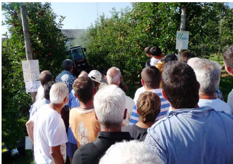
Fig. 4. “On field calibration” meeting organized by the Extension and Experimental Service of FEM in Trentino.

The evaluation of the correct airflow rate based on field conditions is often difficult to achieve for the farmer. The past difficulties in obtaining a sufficient product deposit in the higher part of the canopy lead the operator to use excessive airflow rates than necessary. For these reasons in the near future will be important to look into this aspect during the training courses organized by the Extension Service of the FEM, which have long proposed to farmers technical meetings on the correct application practices (Fig. 3). The “on field” training approach may allow the one operator to learn from the mistakes of the other and also select the proper fan speed on the basis of the orchard characteristics.