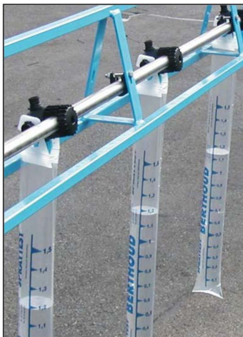
Fig. 2. Spraytest bags.

Two marking points were placed with a distance of 100 m in between with at least 10 to 20 m of free “run in” track before the start of the 100 m track. Farmers/fruit-growers were asked to program their usual application rate and to start a first short run (e.g. about 20 m) at a constant speed. During this run, the rate controller could adjust the control valve to obtain the desired application rate. After this run in, the farmer was asked to stop spraying by shutting of the main valve and the inspector placed 3 spray test sacs underneath three nozzles (Fig. 2).