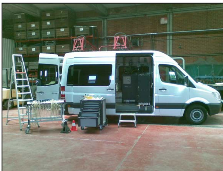
Fig. 1. Inspection van with lift and test equipment (Flanders).

Due to the increasing number of sprayers fitted with a rate controller ILVO felt the need to develop a new time saving and accurate inspection method for spray rate controllers.