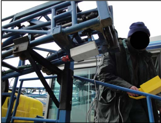
Fig. 5. Testing in practice.

As one can see the complete inspection procedure has been shortened and the new method has a lot of advantages. The driver can completely concentrate on driving and maintaining a constant speed. There is also no need to stop and restart at the first marking point resulting in a more accurate measurement and saved time. Also important to mention is that while performing the test the real time flow rate can be read out so while driving the inspector can already determine if the spray rate controller works correct. Furthermore after testing, the volume can be read out directly with a known accuracy.