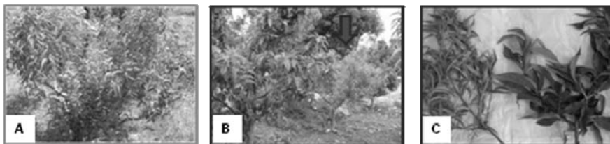
Fig. 1 Characteristic symptoms of AlmWB on peach and nectarine. A. Shoot proliferation on nectarine, B. Comparison of infected (red arrow) vs. healthy peach tree, C. Close up view: infected nectarine branch (left) vs. healthy one (right)

In 2008, About 110 nectarine and peach trees in two orchards in the Sarada plain (South Lebanon) showed characteristic symptoms of shoot proliferation; smaller leaves with a light green color (Fig. 1). Nested PCR and sequencing confirmed infection by AlmWB. Farmers eradicated all symptomatic trees.