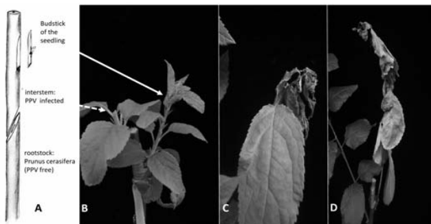
Fig. 1 A + B: double grafting; white arrow: shoot of a seedling in the testing system; dashed arrow: virus infected 'Katinka' after decapitation; C: necrosis on the bark and on the shoot tip of 'Wei 499' ('Ortenauer' × 'Ortenauer'); D: strong hypersensitive reaction of a successful grafting of 'Wei 4926' ('Hoh 4941' × 'Hoh 7172'), dying shoot.

A first rating was done after 6 weeks and a second one after 20 weeks. Further more if one could not detect any visible PPV symptoms the virus was serological analyzed by DAS-ELISA with PPV universal antibodies (Bioreba Switzerland) (EPP0 2004).