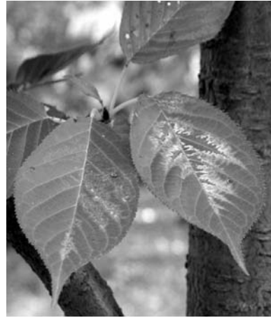
Fig. 12 PDV-infected Prunus serrulata 'Taihaku' leaves