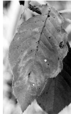
Fig. 4 PPV-infected Prunus japonica leaf