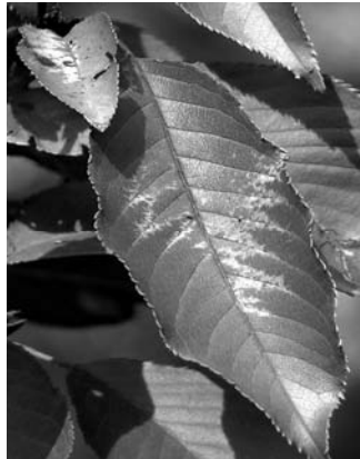
Fig. 13 PDV-infected Prunus yedoensis 'Moerheimii' leaf