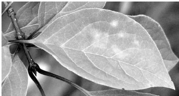
Fig. 14 PDV-infected Syringa yunnanensis leaf