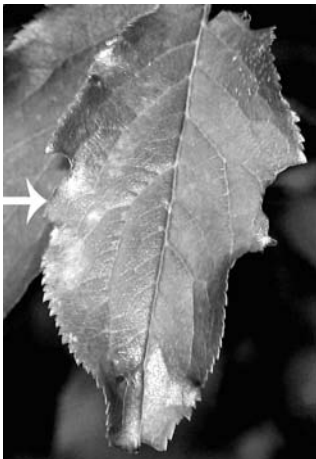
Fig. 9 PDV-infected Prunus salicina (from China) leaf