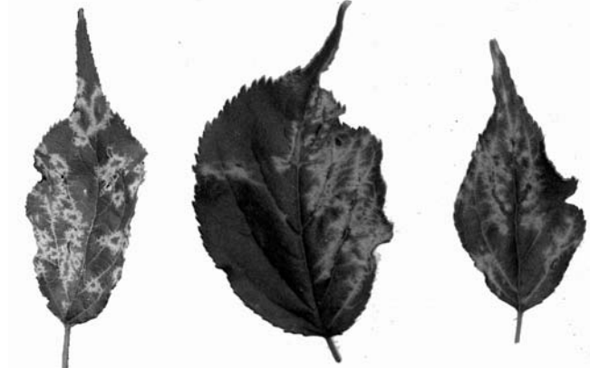
Fig. 8 PDV-infected Prunus mume 'Omoi-no-mama' leaves

in most cases it was symptomless - intensive gumming appeared on the twigs of several years old; P. yedoensis : prominent, pale green spots and tissue clearing along the midribs, light deformation; P. yedoensis 'Moerheimii': conspicuous tissue-clearing mainly along the midribs (Fig. 13); Syringa yunnanensis : transient, light green spots on the leaves (Fig. 14).