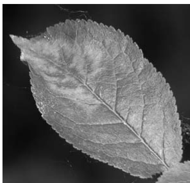
Fig. 6 PPV-infected Prunus sogdiana leaf

From 2005 this work has been extended to studying other viruses on other woody plants. Plants (species and varieties) showing virus symptoms among various thousands of woody plants in two botanical gardens and an arboretum were selected and submitted to indexing on woody and herbaceous indicators, as well as to testing with ELISA for the presence of the following 11 viruses occurring on woody plants: PPV, PDV, PNRSV, CLRV, ASPV, ASGV, ApMV, ACLSV, SLRV, TBRV and ArMV. Up to now, among the 28 suspicious species and varieties, PPV, PDV, PNRSV, CLRV and ASPV have been detected so far. In addition to the 9 species/cultivars formerly mentioned as PPV hosts 3 new species/cultivars: P. glandulosa , P. tomentosa (from Tibet) and P. sogdiana were found to be infected by PPV. The symptoms on the leaves of P. glandulosa were similar but weaker than those observed on the leaves of P. glandulosa 'Sinensis' (Fig. 3). The leaf tissue along the secondary midribs of P. sogdiana turned to pale green (Fig. 6). P. tomentosa (from Tibet) showed distortion and epinasty on the first leaves; later chlorotic spots developed which became necrotic by mid-summer (Fig. 7).