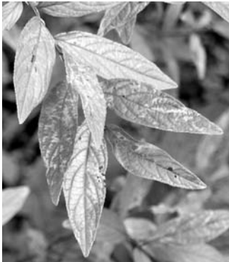
Fig. 3 PPV-infected Prunus glandulosa leaves