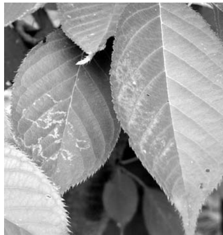
Fig. 10 PDV-infected Prunus serrulata 'Ichiyo' leaves