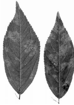
Fig. 2 PPV-infected Prunus glandulosa 'Alba Plena' leaves