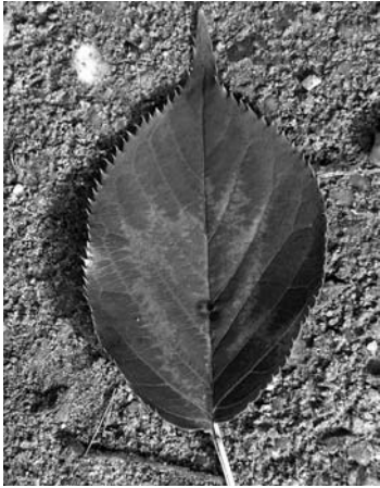
Fig. 11 PDV-infected Prunus serrulata 'Pink Perfection' leaf