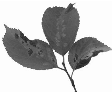
Fig. 7 PPV-infected Prunus tomentosa (from Tibet) leaves

Seventeen species/varieties showing symptoms were found to be infected with PDV. The symptoms observed were the following: Lonicera caucasica : pale green spots and tissue clearing along the veins; L. maackii : pale green spots; L. sachalinensis : large, transparent, light green spots and tissue-clearing along the veins; Prunus mume 'Omoi-no-mama': prominent light green rings and tissue clearing along the veins, leaf distortion (Fig. 8); P. salicina (from China): light green ringspots and tissue-clearing (Fig. 9); P. spinosa 'Plena': large, transparent, light green spots on the leaves; P. spinosa 'Purpurea' no symptoms on the dark red leaves, but heavy gumming appears on the tree trunk; P. serrulata 'Amanogawa', P. serrulata 'Ichiyo' (Fig. 10); P. serrulata 'Pink Perfection' (Fig. 11); P. serrulata 'Taihaku' (Fig. 12) and P. serrulata 'Yedo-sakura': oak leaf patterns with yellow bands and sparse spots on the leaves; P. subhirtella 'Plena': yellow transient spot on the leaves; P. tenella : in early springtime transient pale green spots appeared, later and