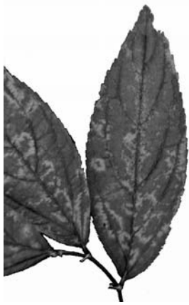
Fig. 1 PPV-infected Prunus glandulosa 'Sinensis' leaves

dark-red or purple, mainly along the main and secondary veins, with a higher intensity on the lower surface. The lower leaves of Prunus x blireana exhibited similar symptoms along the main, secondary and tertiary veins. On dark-red leaved trees such as P. cerasifera 'Nigra' and Prunus x davidopersica 'Atropurpurea' symptoms were not visible (Sebestyén et al., 2008).