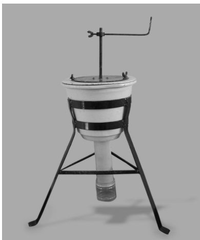
Figure 1 Outer view of pulse beetle egg removal device .

Egg removal device for pulse beetle (Mohan, 2005) was used to assess the efficiency of its egg removal against other important stored-product insects namely, T. castaneum , R. dominica and L. serricornis . The device comprises of an outer container enclosing an inner perforated container (Fig. 1). The outer container (18.5 cm high and 21 cm diameter) was made of aluminum and the inner perforated container made up of galvanized iron sheet with a diameter of 15 cm. The outer container and inner perforated container (3 mm perforations) were arranged in such a manner that a gap of 3 cm exists between them. The containers were provided with a lid at the top, the lid having an opening at its centre. A rotatable rod is provided with smooth brushes of length 4.5 cm fixed equispaced (Fig. 2). The sides of brushes touch the inner walls of the inner perforated container. The rotatable rods are fixed to the bottom of the inner container and pass through the opening, connecting the lid at the top. The other end of the outer container is provided with a transparent container to collect the insects which fall down from the inner perforated container.