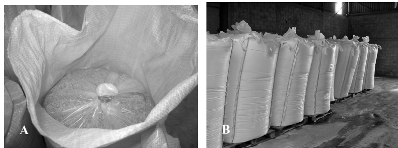
Figure 2 A: 60kg SuperGrainbag with Corn seeds. B: SuperGrainbag -HC™ storing paddy inside woven protective polypropylene bag.

For smaller unit containers of 60 kg to 90 kg capacity, a transportable SuperGrainbag™ (SGB) is used (Fig. 2A). The SGB is a 3-layer coextruded plastic with thickness of 0.078 mm, 3 cc/m 2 /day permeability levels for oxygen and for water vapour of 8 g/m 2 /day. Using the same material, the SuperGrainbags-HC™ has become available for use with mechanized loading, which handles up to a 2-tonne capacity for bags or bulk storage (Fig. 2B).