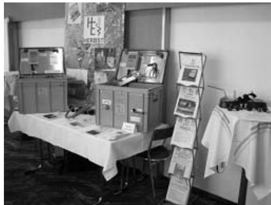
Fig. 2 Little presentation of testing devices in Brno.