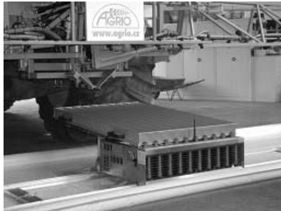
Fig. 1 Sprayertest 1000 at work

The controlling authority has got an internet access to this data base and is able, by an analysis software, to make special selections. Already in 1995 this online version was developed for the Beratungsring Südtirol (Italy) and is also used by German test stations in Bavaria, North Rhine-Westphalia, Hessen and Thuringia. This proceeding was introduced during the SPISE workshop in an own lecture.