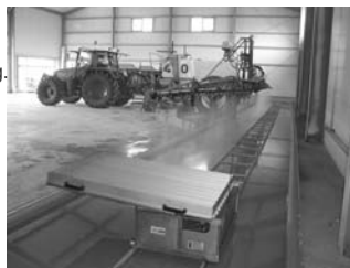
Fig. 5 Example from Germany where the inspection is delegated to the Federal States and carried out by approved agricultural workshops

The following proposal focusing on technical matters shows the action of implementation in the Member States taking the limited availability of harmonized EN standards into consideration. This proposal is characterized by the following items: