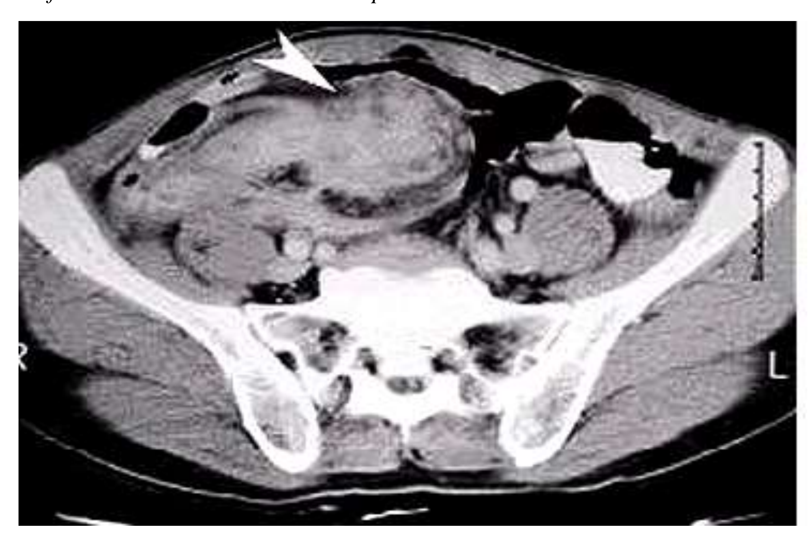
Figure 3: CT of actinomycosis showing an ill-defined, heterogenous mass in the right lower quadrant.