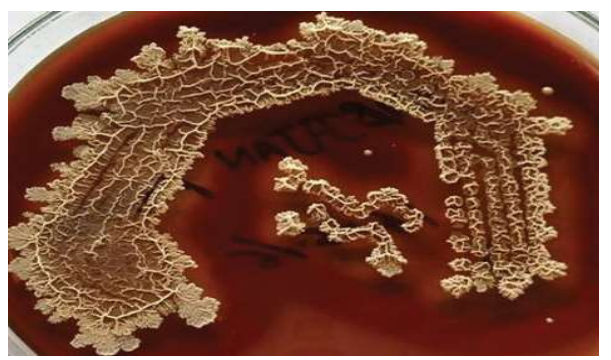
Figure 2: colony morphology on anaerobic culture.