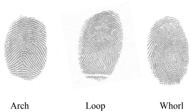
Figure 1.2: Fingerprints global level structure