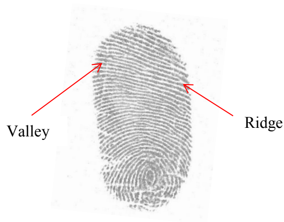
Figure 1.1: The ridge and valley

A fingerprint is the representation of the epidermis of a finger. It comprises of an example of interleaved edged and valleys as shown in Figure 1.1. Fingertip edges formed throughout the years to permit people to handle and grasp an object. Unique fingerprint edges structure through a mix of hereditary and ecological components impression shaping is like the development of vessels and veins in angiogenesis (Bharadi, 2014).