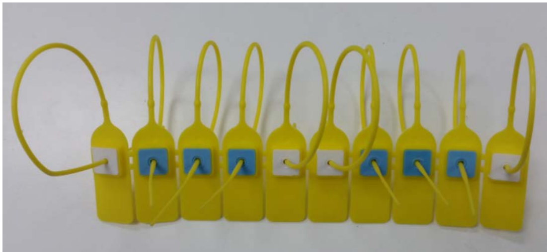
Figure 1.4: Locking of seal with wrong orientation of jaw.

As can be seen in Figure 1.4, some cavities in the mat need to be sealed by inserting in opposite way. This is the problem that always occurred and need to be solved immediately. This is due to the fact that when a defect in any one cavity, the whole mat will be rejected.