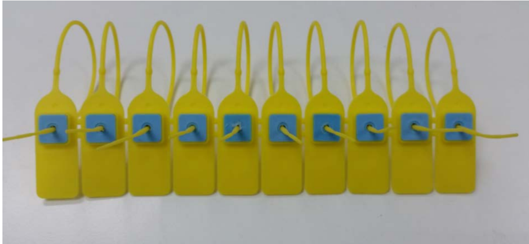
Figure 1.3: Locking of seal with correct orientation of jaw.