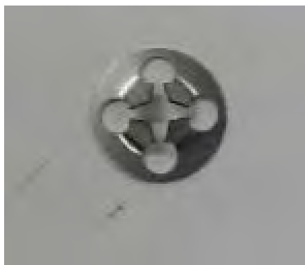
Figure 1.1: Jaw used for Mini Jawlock.

Industrial people have found a way to create new type of seal whereby it reduces cost and can be customized. Essentra is a company based in United Kingdom which has brought over the company Abric recently. Even though, the top management has changed, the objective and main product still have not changed. This company produces two types of seal which are plastic seals and metal seals. Jaw is a component present in the plastic seal. The function of this jaw is to prevent the pull back of insertion and make sure a strong lock between the seal and the product that needs locking. The jaw is a metal part which being inserted in the plastic seal before being covered with plastic cap. Figure 1.1 is sample image of jaw which gives higher strength for the seal when locking.